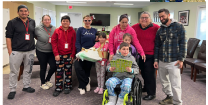
Bingo! Our families really love the Bingo games. Participation and sponsorship opportunities are available. If you wish to sponsor a bingo evening or on a weekend day, please do not hesitate to contact us at 409-762-8770. Thank you to everyone who puts so much effort in the activities at the house for our families!