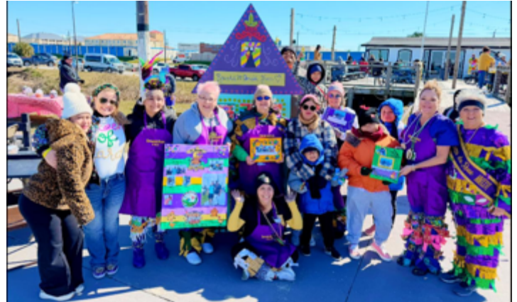
It was a cold and windy day, but the Gumbo was hot, and the Chicken Run full of fun and joy. And one of our children and his Dad both caught chickens and trophies! This is an annual event that is so much fun, and the proceeds come to our House and to Shriners. Thank, da Krewe du Roux for a fabulous time.