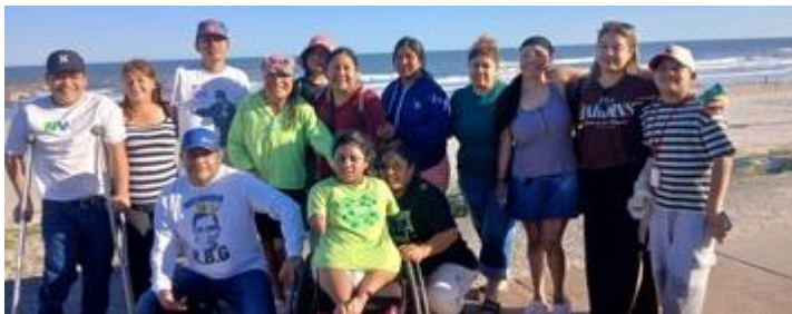
Most visitors come Galveston for the beach. We decided it was time for our guests, too, to enjoy the salt air. Our weekly beach field trip is already a major highlight. Each Monday, we bring the families to a different section of the seawall. One week, it was