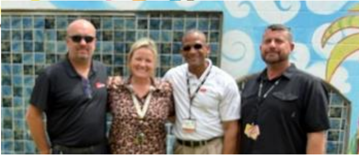
UTMB's Fire Safety crew paid us a visit and gave us some sound directives. UTMB safety and maintenance teams make sure that our House remains safe and secure. We are indebted for all they do for our House.

where the seawall ends. The evening was filled with laughter, seashell searches, meeting a local raccoon wrangler, and creating unforgettable memories by the shore. Another outing included fishing (and catching!)