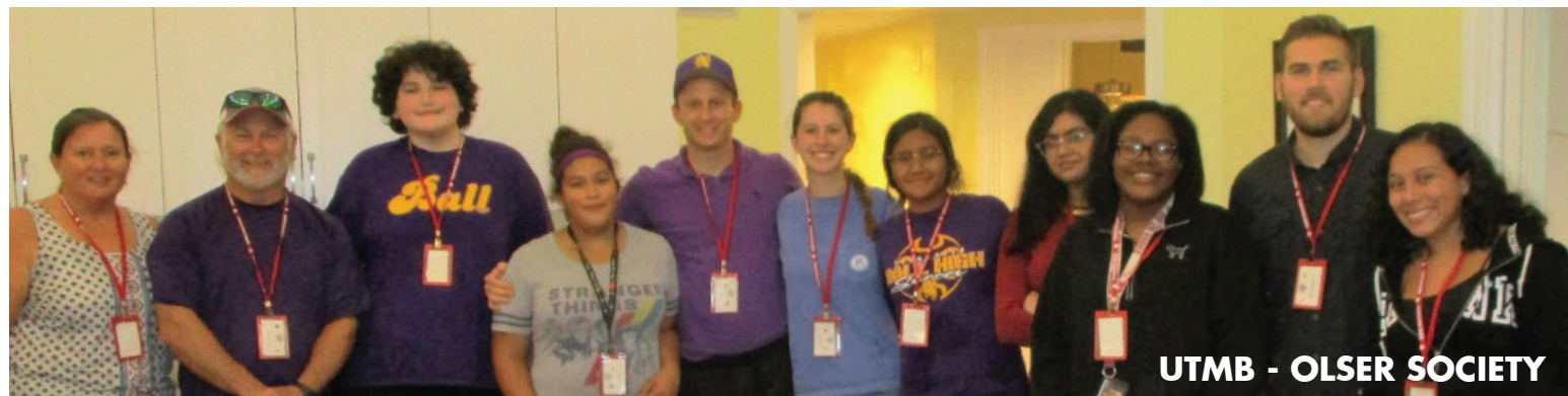
UTMB - OLSER SOCIETY