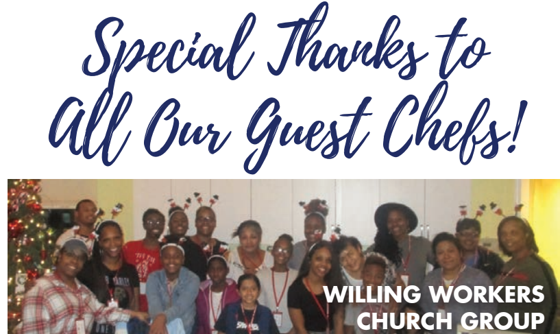
WILLING WORKERS CHURCH GROUP