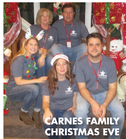
CARNES FAMILY CHRISTMAS EVE