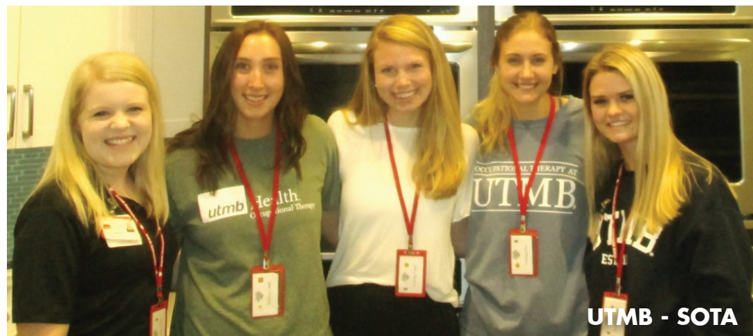
UTMB - SOTA