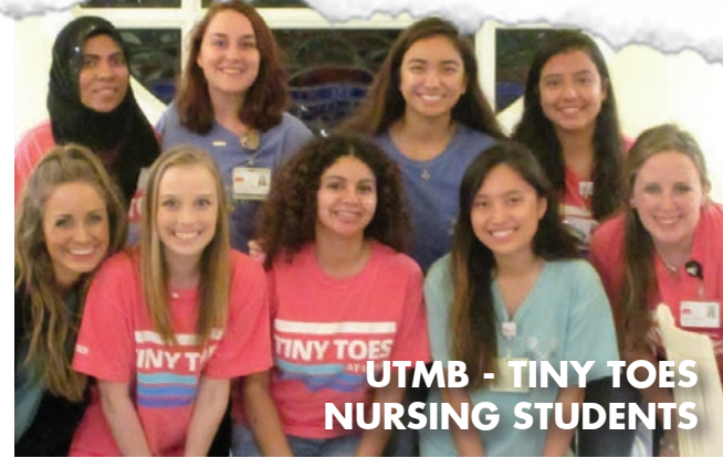
UTMB - TINY TOES NURSING STUDENTS