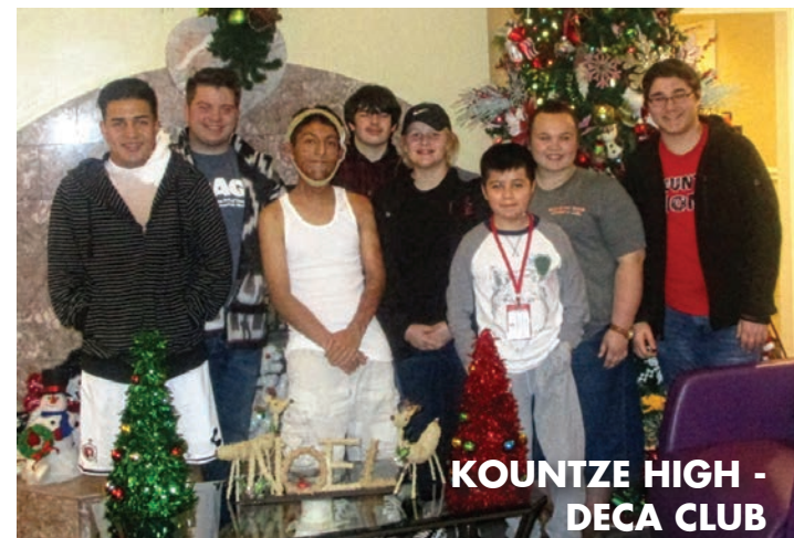
KOUNTZE HIGH - DECA CLUB