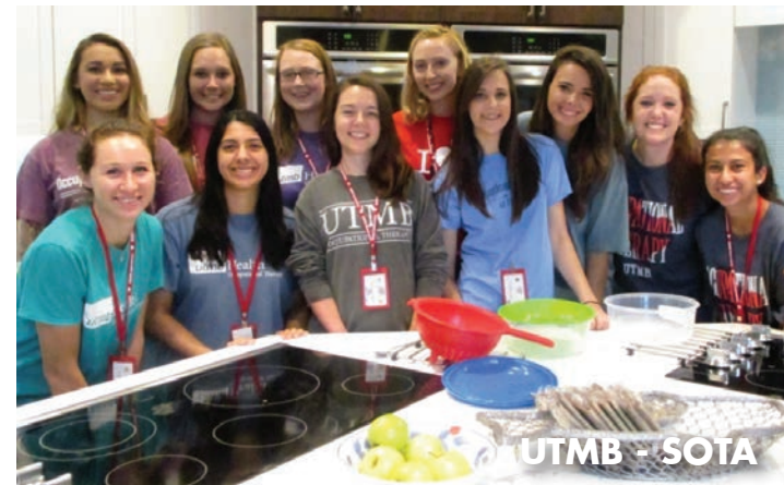
UTMB - SOTA