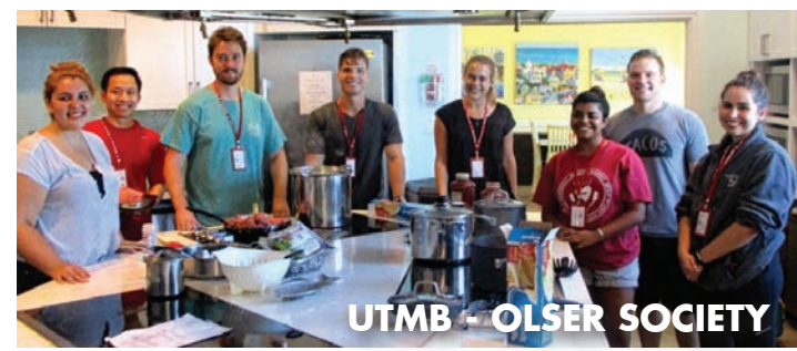
UTMB - OLSER SOCIETY