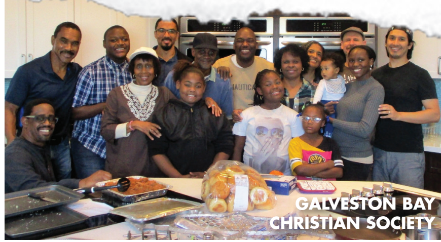
GALVESTON BAY CHRISTIAN SOCIETY