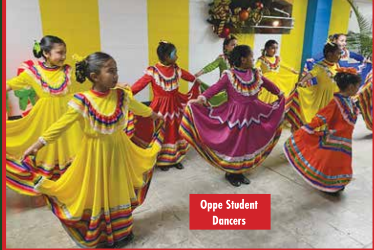
Oppe Student Dancers