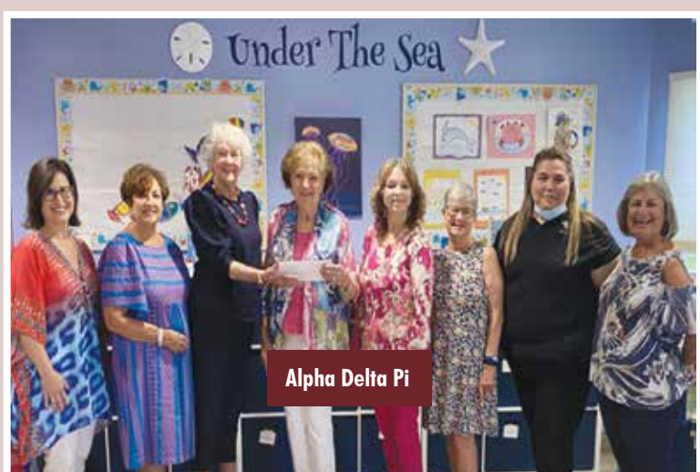
Alpha Delta Pi