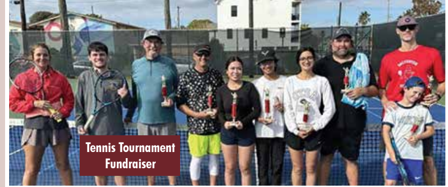
Tennis Tournament Fundraiser