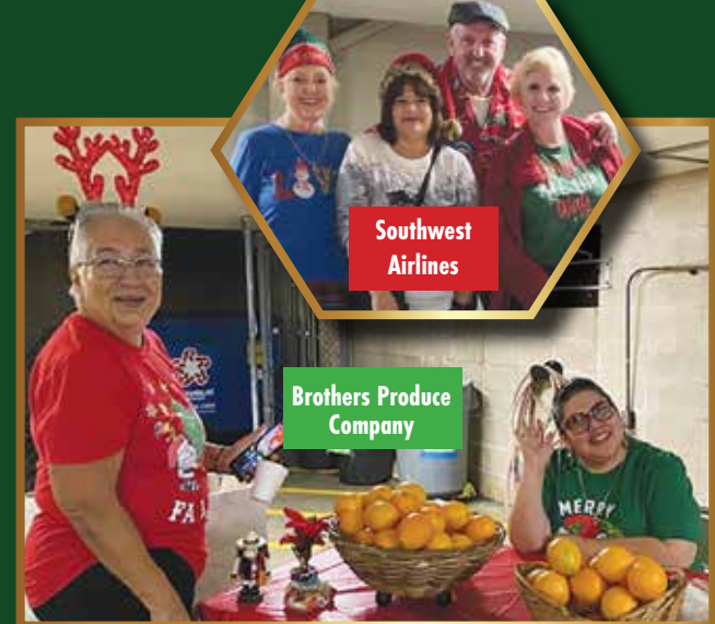
Brothers Produce Company