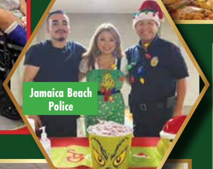
Jamaica Beach Police