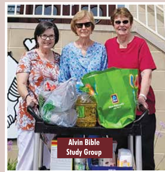
Alvin Bible Study Group