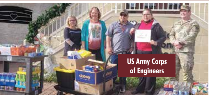
US Army Corps of Engineers