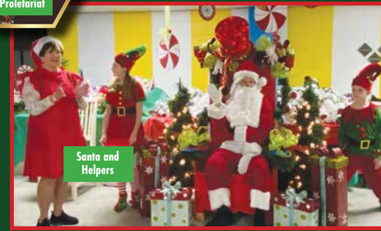
Santa and Helpers

After a several year hiatus due to Covid, our annual Lights of Love returned this year. It is a celebration of Galveston and the House. It was a rainy, dreary night outside, but it was a heart-warming evening at our House thanks to the many people and organizations responsible for so much fun for all ages.