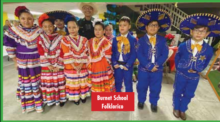
Burnet School Folklorico