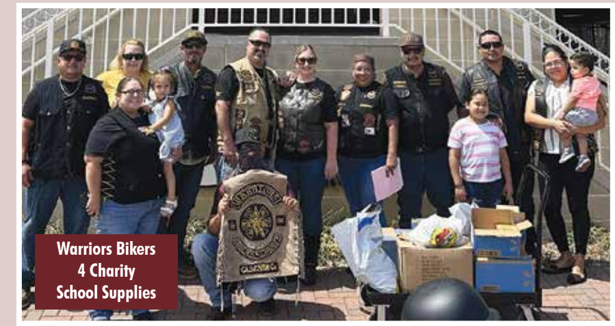
Warriors Bikers 4 Charity School Supplies