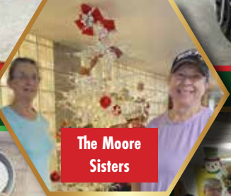
The Moore Sisters