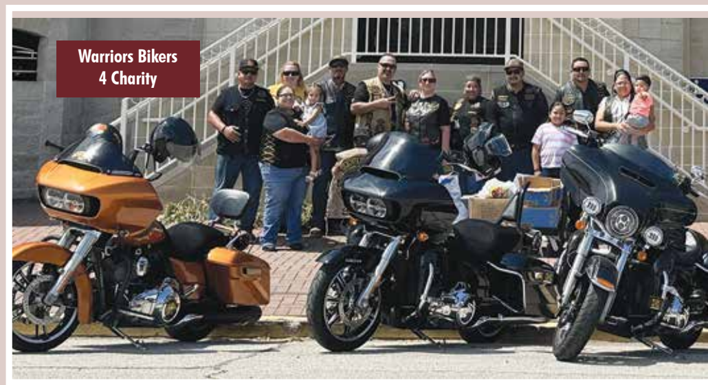
Warriors Bikers 4 Charity