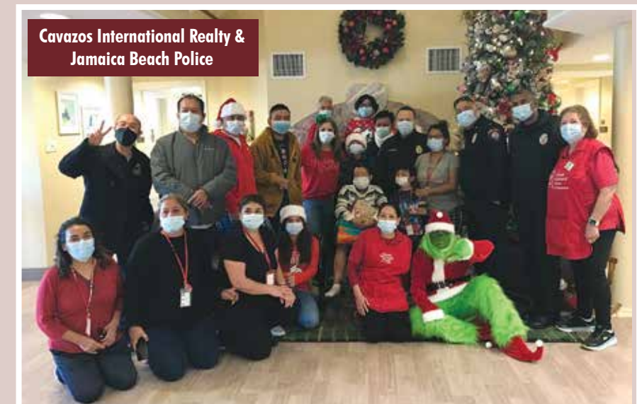
Cavazos International Realty & Jamaica Beach Police