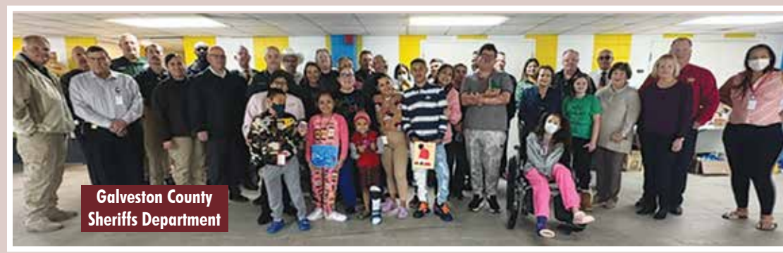
Galveston County Sheriffs Department